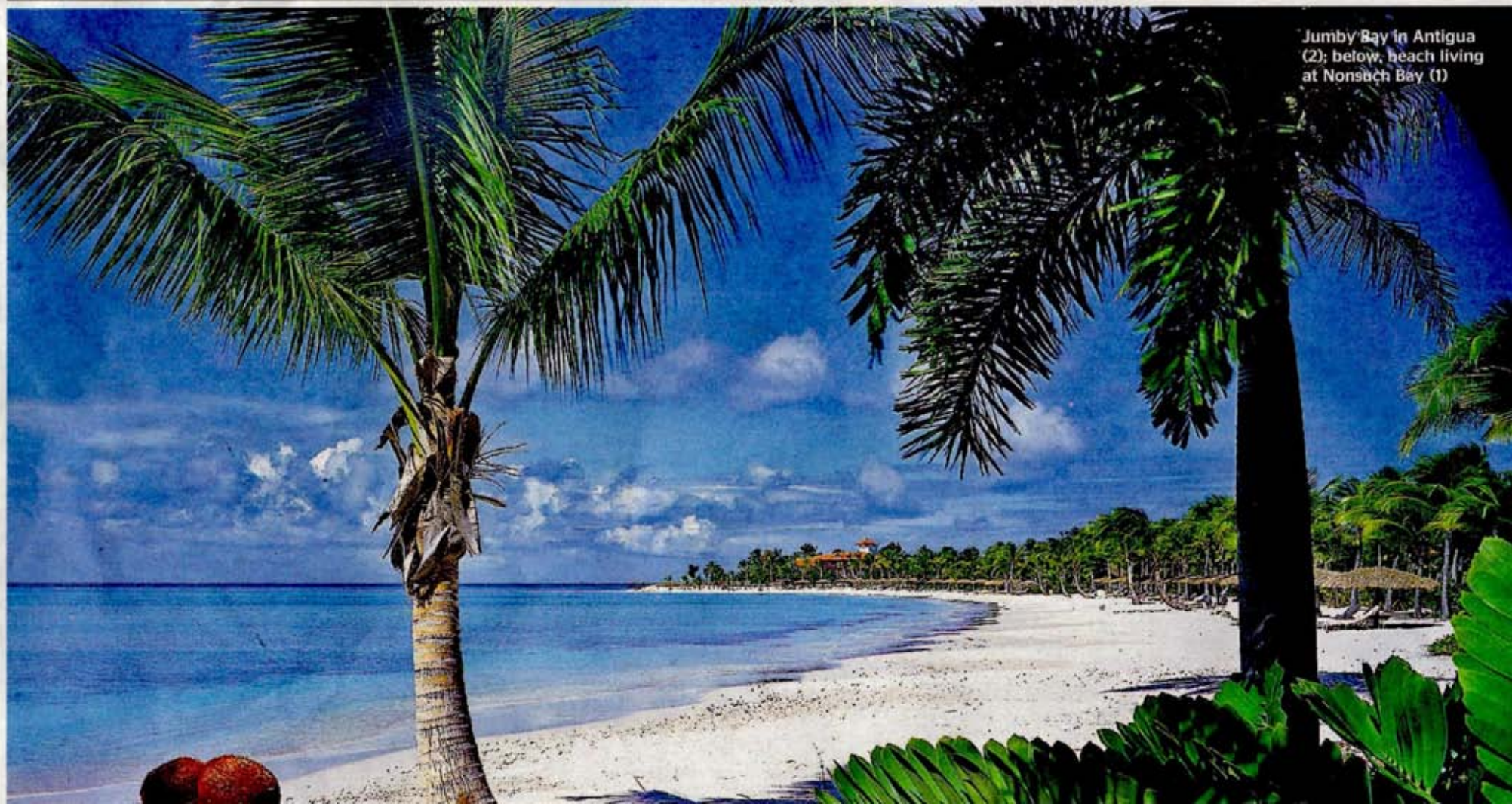
Jumby Bay in Antigua (2); below, beach living at Nonsuch Bay (1)

A dad-with-kids Arctic trip works wonders